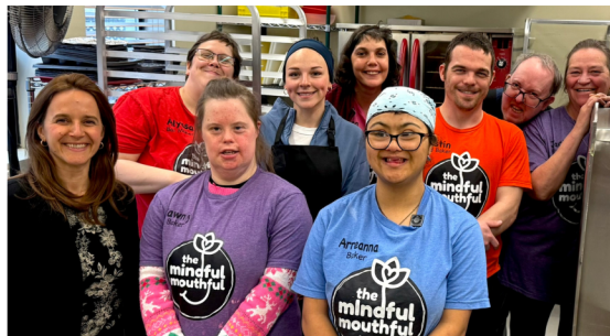
Some of the team behind every delicious bite at The Mindful Mouthful.

However, infrastructure and distribution challenges have consistently limited our opportunities for growth. We could not significantly expand production because we were missing some key equipment and lacked an affordable means of delivering products to a broader market. These factors led to some financial strain.