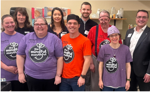
Island Savings and The Mindful Mouthful: true partners in success.