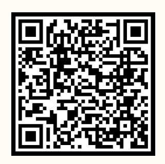
Early Years Professional Development: