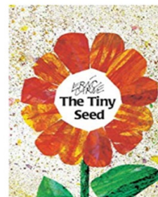
The Tiny Seed