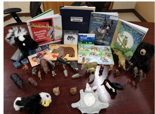
Wild Forest Animals

Can't make it in to pick up or drop off a item ? That's okay !Call to schedule a time with one of our Consultants to bring the items you need to YOU!